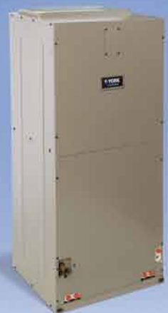
LX SERIES AHE MODEL SINGLE-PIECE DESIGN

Everyone wants time to relax and be comfortable. That's why we created LX Air Handlers, so you get a perfect match with your air conditioner or heat pump. And you'll like the confident feeling that comes with dependable performance, energy efficiency and operating economy. We give you the best design so you don't have to sweat the details. And because it's built by York—the industry leader in innovative design—you know your system won't be down when you want some down time.