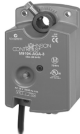
M9102/M9104 Series Electric Non-Spring Return Actuator

If the M9102 or M9104 Series Electric Non-Spring Return Actuator fails to operate within its specifications, replace the unit. For a replacement electric actuator, contact the nearest Johnson Controls® representative.